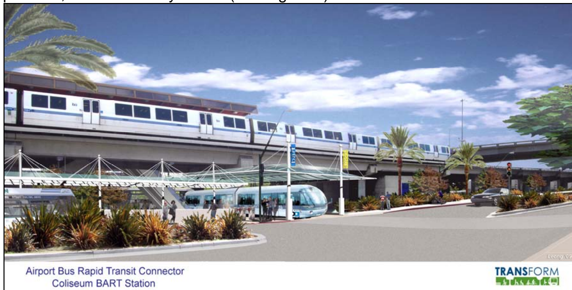
Figure 4 - The proposed Coliseum RapidBART station would be clearly marked, covered and inviting.

The Coliseum RapidBART Station would ideally be located at street level of the east end of the existing BART station, perpendicularly under the Coliseum BART Station and across San Leandro Street from the Hegenberger on-ramp. This space under the BART tracks and platform is currently vacant. There is a No Stopping zone in the curb space in this area, and the RapidBART station would be about 300 feet east of the curbside berthing area currently used by AirBART and AC Transit buses. Escalators, elevators, and stairs would link the RapidBART station directly to the east end of the BART station platform, located directly above (see Figure 3).