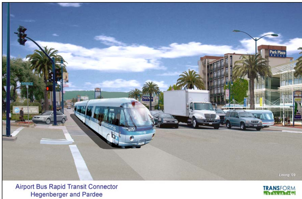
Figure 3 – Right-hand queue jump lanes would allow RapidBART to bypass traffic congestion, greatly improving speed and reliability. New stop is visible across intersection

Queue jumpers are particularly applicable along major roadways like Hegenberger, where lack of available right-of-way may preclude a continuous exclusive-busway.