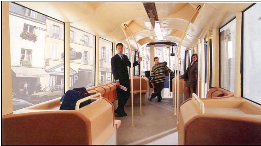
Figure 1. RapidBART proposed interior emulates the comfort and ease of rail with 3 or 4 doors that open wide and no fare collection.

The RapidBART is designed to be much faster, frequent, more comfortable, reliable and convenient than the current AirBART shuttles. It will have many similarities to rail, but using rubber tires. Much of the operational and technical information for the RapidBART proposal is based on the 2002 EIR proposal for “Quality Bus”.